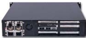
▲ PRC-2204A rear view